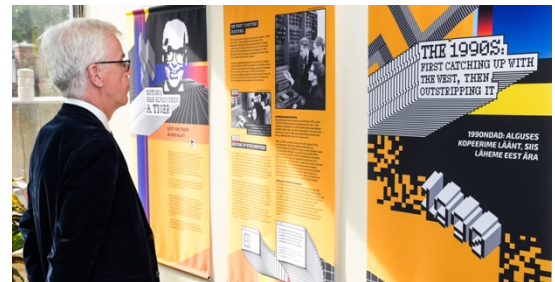
The opening of the travelling exhibition in VEMU Estonian Museum Canada, 23 September 2023.